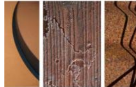
Etchings-Sun, Ice & Sea Grass by Katherine Loveland