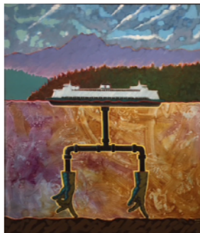
Believe in Ferries