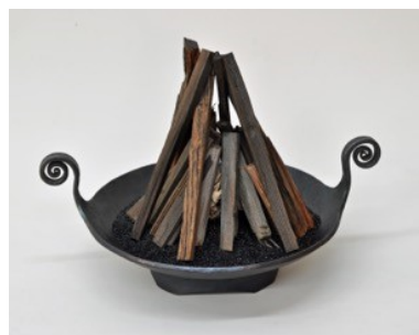
Offering by Phillip Baldwin