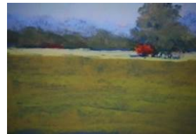
Red Tree by Denise Champion