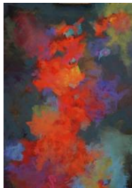
Interaction by Denise Champion